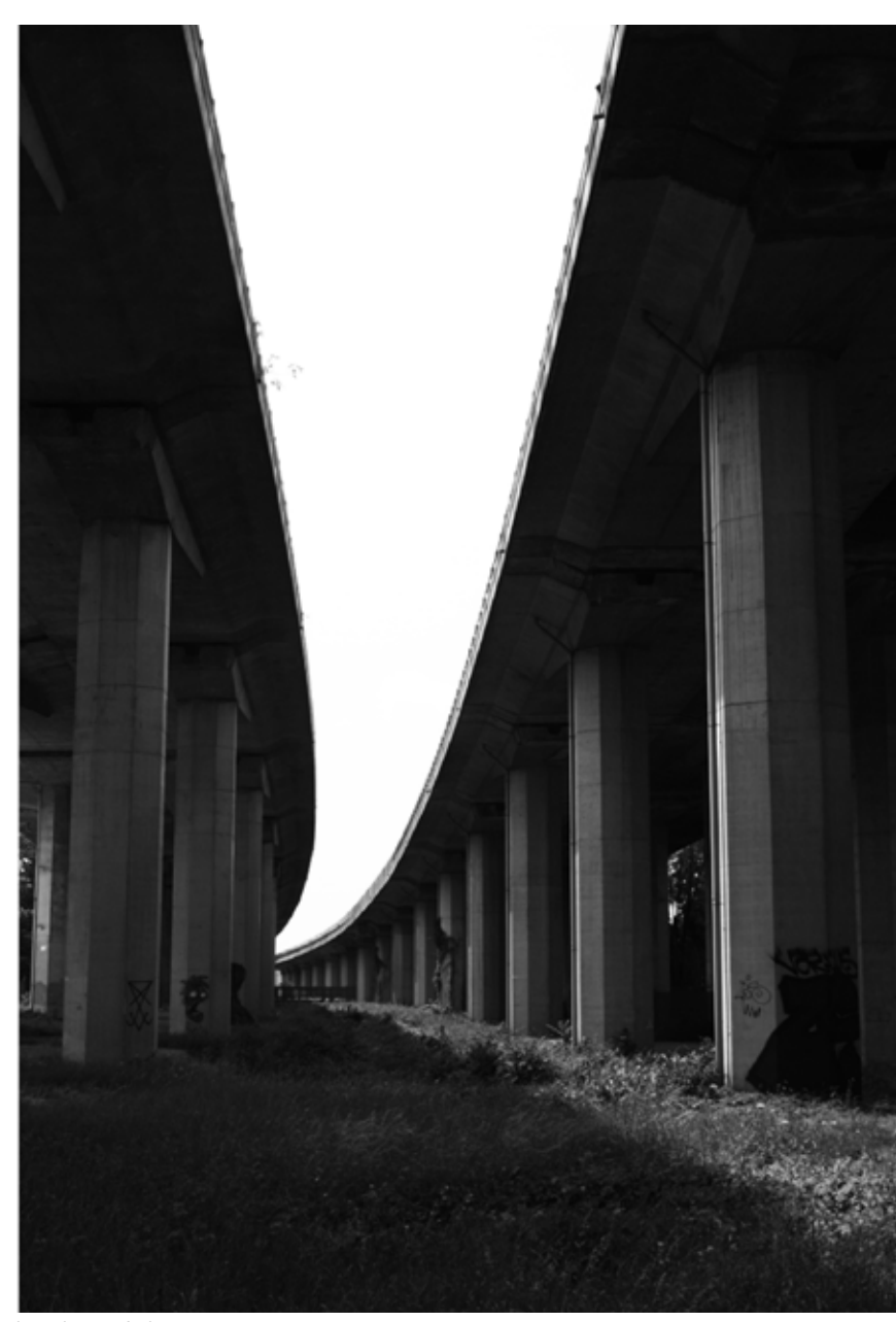
Lambro - Axis

/ WS 04 / Louise Wright Nature on the border