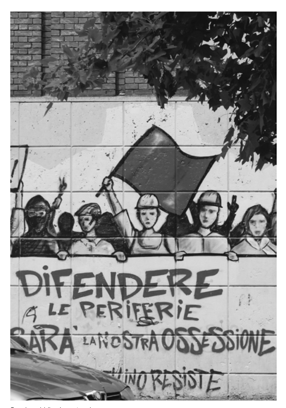
Spazio pubblico Lorenteggio

The project aim to incorporate new programs by opening up to possibilities. Our aim is through food and food-scapes to facilitate the appearance of unexpected uses and social groupings.