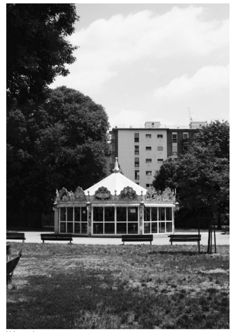
Livigno - Jenner

http://atlas-for-the-end-of-the-world.com